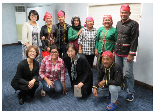
A feasibility study workshop (Manila, The Philippines on 7 -8 October, 2019)

In Viet Nam, the class observations in 2 pilot schools and the feasibility study workshop were conducted in Hanoi on 24 - 25 October.