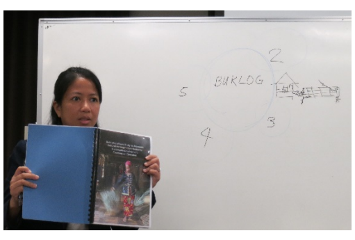
A meeting about the project progress with IRCI and NCCA (Tokyo, Japan on 13-14 September, 2018)