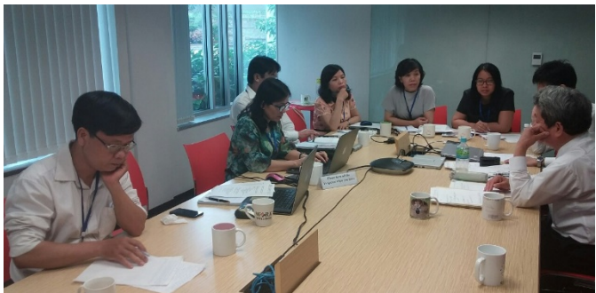
A meeting about the project with IRCI, VME and VNIES (Hanoi, Viet Nam on 17-18 May, 2018)