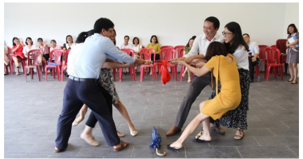
The Teacher's training workshop<sup>2</sup>