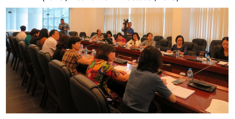
A feasibility study workshop (Hanoi, Viet Nam on 25 October, 2019)