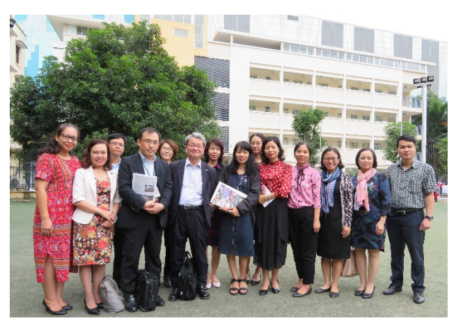
A class observation in Thuc Nghiem Secondary school (Hanoi, Viet Nam on 24 October, 2019)