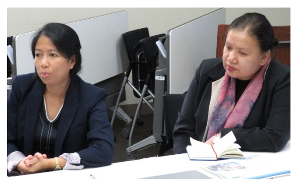
A meeting about the project with IRCI and NCCA (Tokyo, Japan on 30-31 May, 2018)