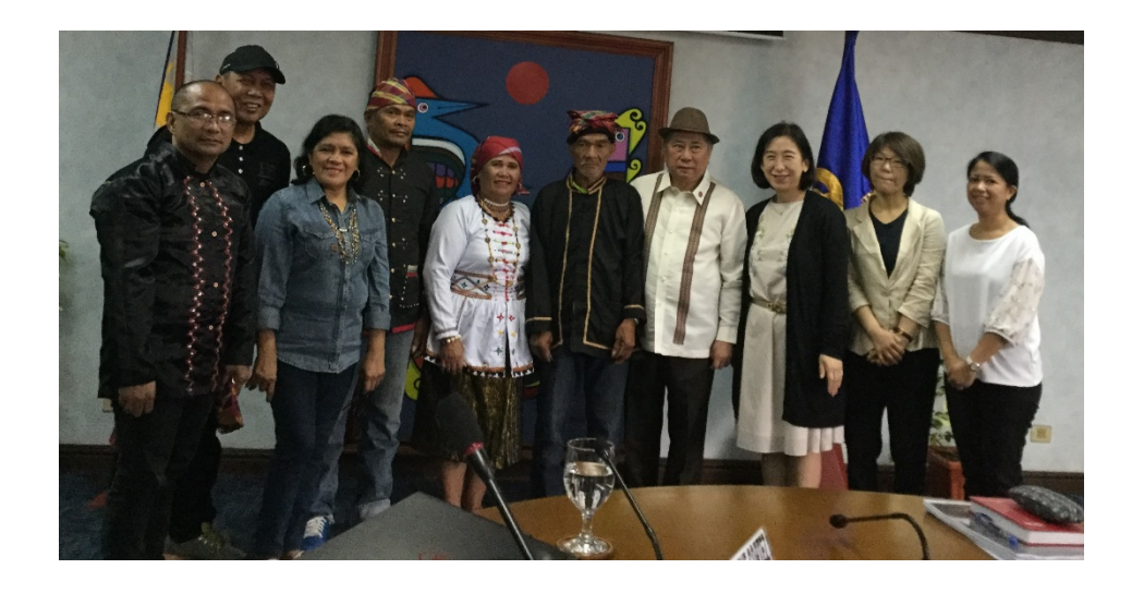
A workshop of the draft guidelines with IRCI and NCCA (Manila, The Philippines on 13 November, 2018)