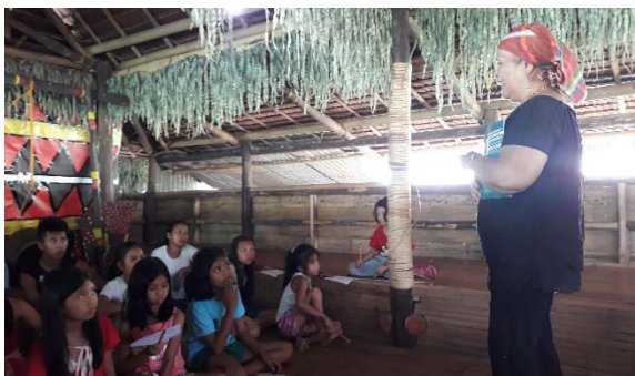
The meeting with culture masters and NCCA<sup>1</sup>