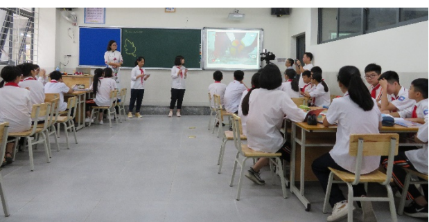
A class observation in Yen Hoa Secondary school (Hanoi, Viet Nam on 24 October, 2019)