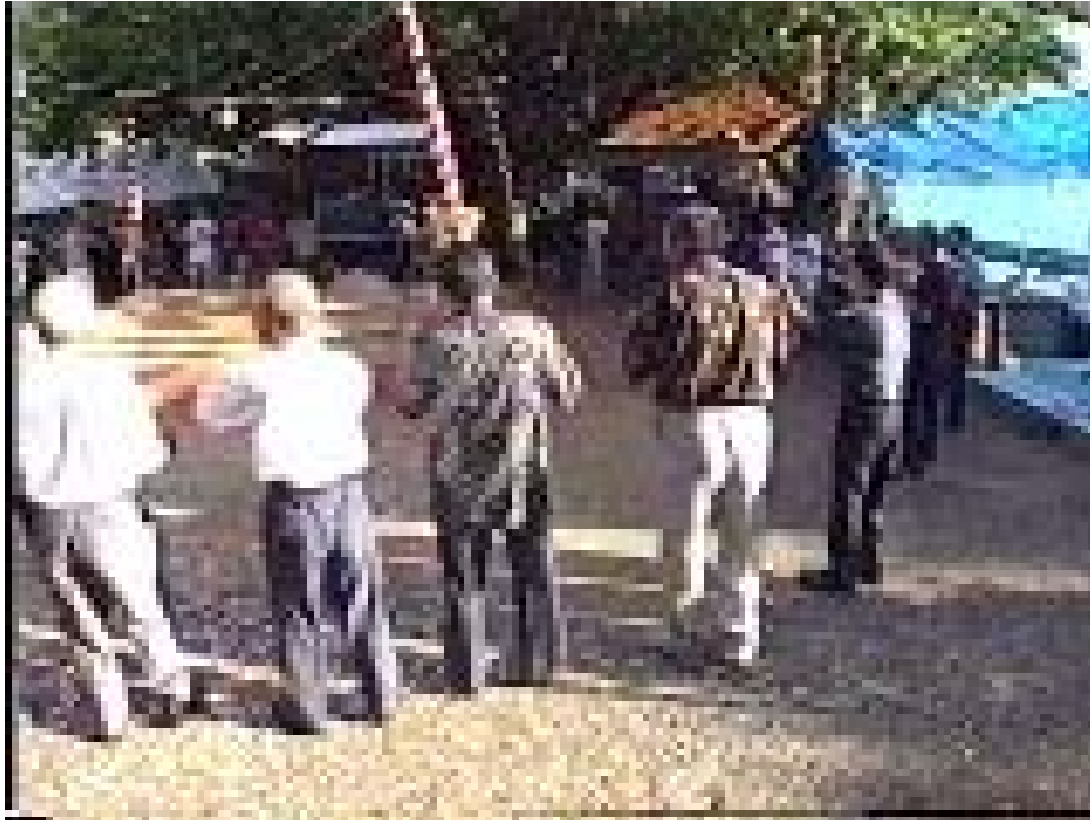
Two styles of Hachigatsu Odori of Amami Oshima