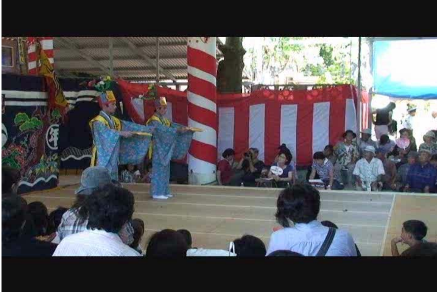
Hachigatsu Odori of Tarama Jima

Cultural heritage: Classical performing arts, folk dances