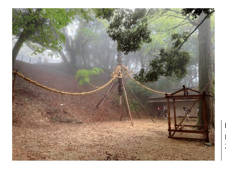
Figure 11 Reconstruction status as of April 2023

The event that was held in 2023, the first time after the disaster, had a limited number of spectators due to the COVID-19 pandemic, and thus the removal of the stands did not impact the event. However, once a similar number of spectators as before the pandemic returns, it will become difficult to accommodate all of them at the given spot where the event is held. Thus, the bearers need to discuss how to accommodate the spectators in the future.