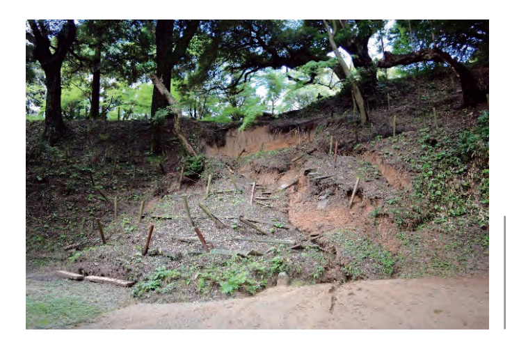
Figure 9 The status in an area just after a landslide

surrounding ground was loose due to the rain, other landslides could have happened in the same area if heavy rain were to have occurred again.