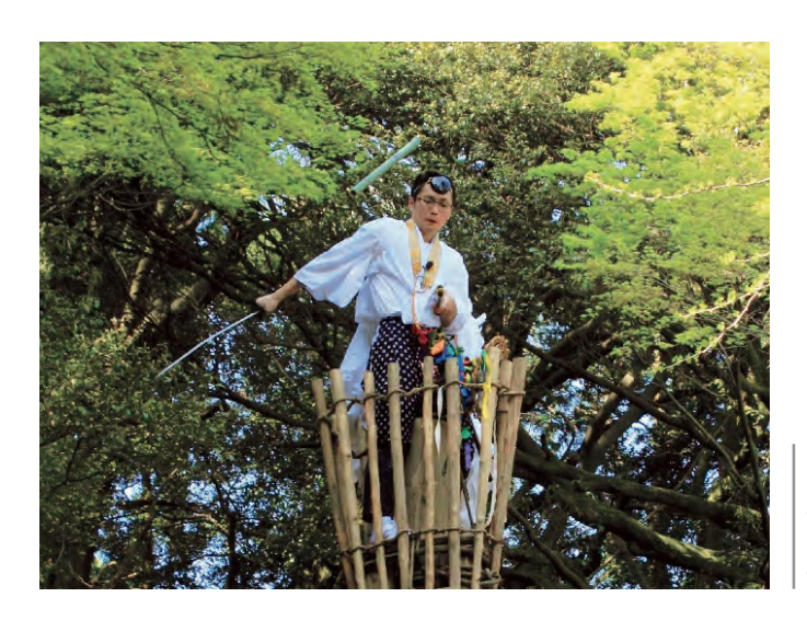
Figure 7 Heikiri

administrative officers who supported them.