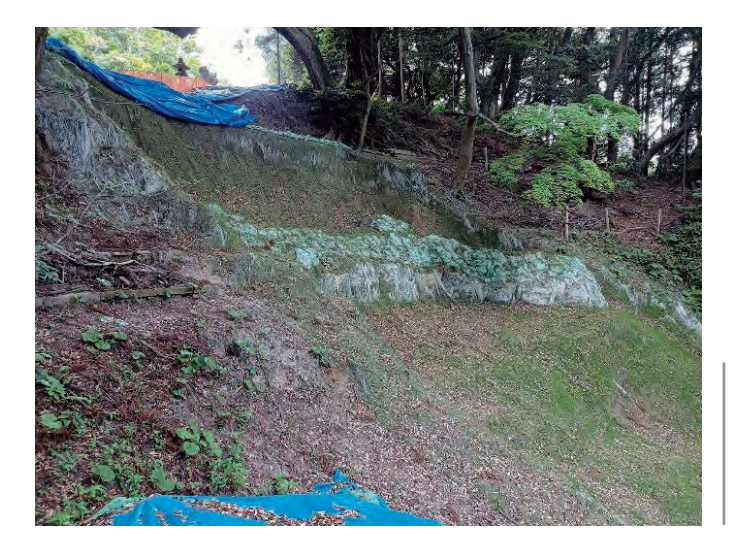
Figure 10 Reconstruction status as of June 2022