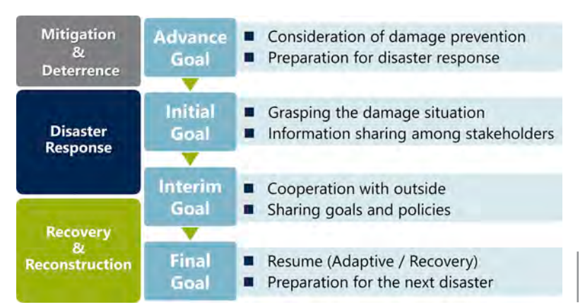
Figure 5 Disaster response flow

The first tasks necessary just after disaster occurrence are to ascertain the damage status and share the information among related parties. Confirmation of the safety of bearers and stakeholders and information on the damage status of tools and facilities are needed. It is also important to share the information among related parties. Correspondence after disasters can be smoothly conducted if the means of confirming people's safety, ascertaining the damage situation, and sharing the information are discussed and decided beforehand.