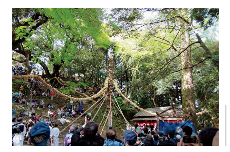
Figure 6 Tokakuji no Matsue