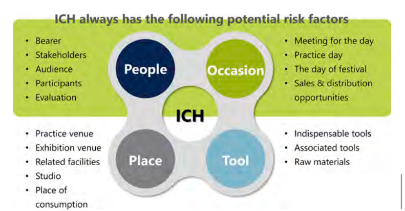
Figure 4 Estimating disaster risk

'Occasions' do not only determine the way current festivals and performing arts are held. Through these occasions, members share their experiences and time, and pass their knowledge of the events on to other members of the next generation. This shows that these occasions are indispensable factors to continue with the passage of festivals and performing arts to future generations. The efforts to contain the recent COVID-19 pandemic had significant impact on ICH with the loss of these 'occasions' considered to have been the largest. People's efforts to avoid crowds to prevent infections deprived bearers of ICH of these occasions and forced traditions into crisis. This impact continues even now.